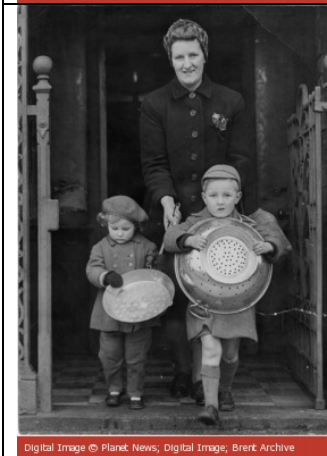
Digital Image © Planet News, Digital Image, Brent Archive

http://www.20thcenturylondon.org.uk/server.php?show=conObject.6164