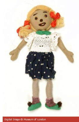
Digital Image © Museum of London

http://www.20thcenturylondon.org.uk/server.php?show=conObject.6163