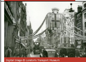
Digital Image © London's Transport Museum

http://www.20thcenturylondon.org.uk/server.php?show=conObject.6175