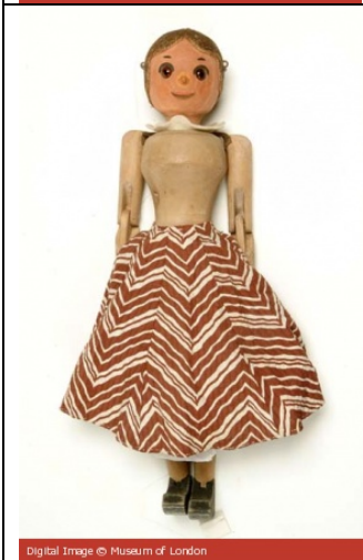
Digital Image © Museum of London

http://www.20thcenturylondon.org.uk/server.php?show=conObject.6166