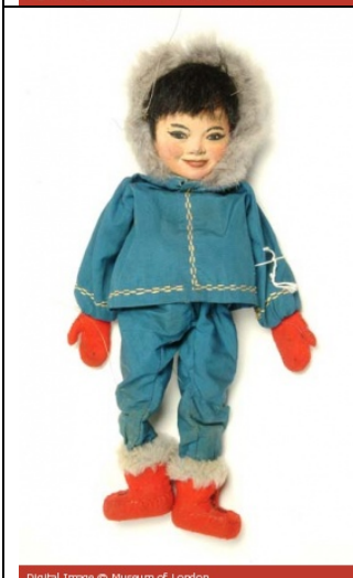
Digital Image © Museum of London

http://www.20thcenturylondon.org.uk/server.php?show=conObject.2326